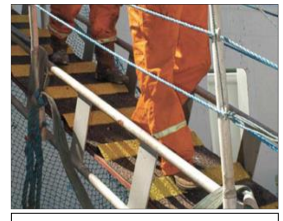
Example of good high-traction anti-slip surface

For further guidance refer to the Merchant Shipping (means of access) Regulations; 1988 SI; 1637 "The Master is obliged to ensure a safe means of access to the vessel at all times". With regards to this regulation and the advice provided in the "Code of Safe Working Practices for Merchant Seamen", chapters 6 and 18. The following points must be applied whenever the gangway is in use;